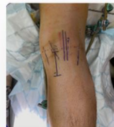
Monday 4th March 2024 Lower Limb Trauma Course Cadaveric Practical Pelvic Trauma Approaches