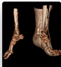
Wednesday 6th March 2024 Foot & Ankle Trauma Course Cadaveric Practical Foot & Ankle Trauma Approaches