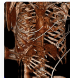
Thursday 7th March Ribs Fixation Course Cadaveric Practical Rib/Trauma Approaches