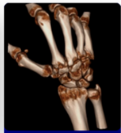
Saturday 9th March 2024 Hand & Wrist Trauma Course Cadaveric Practical Hand & Wrist Trauma Approaches