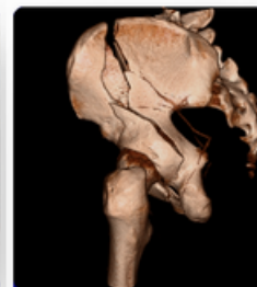
Tuesday 5th March 2024 Pelvic Trauma Course Cadaveric Practical Limb Trauma Trauma Approaches